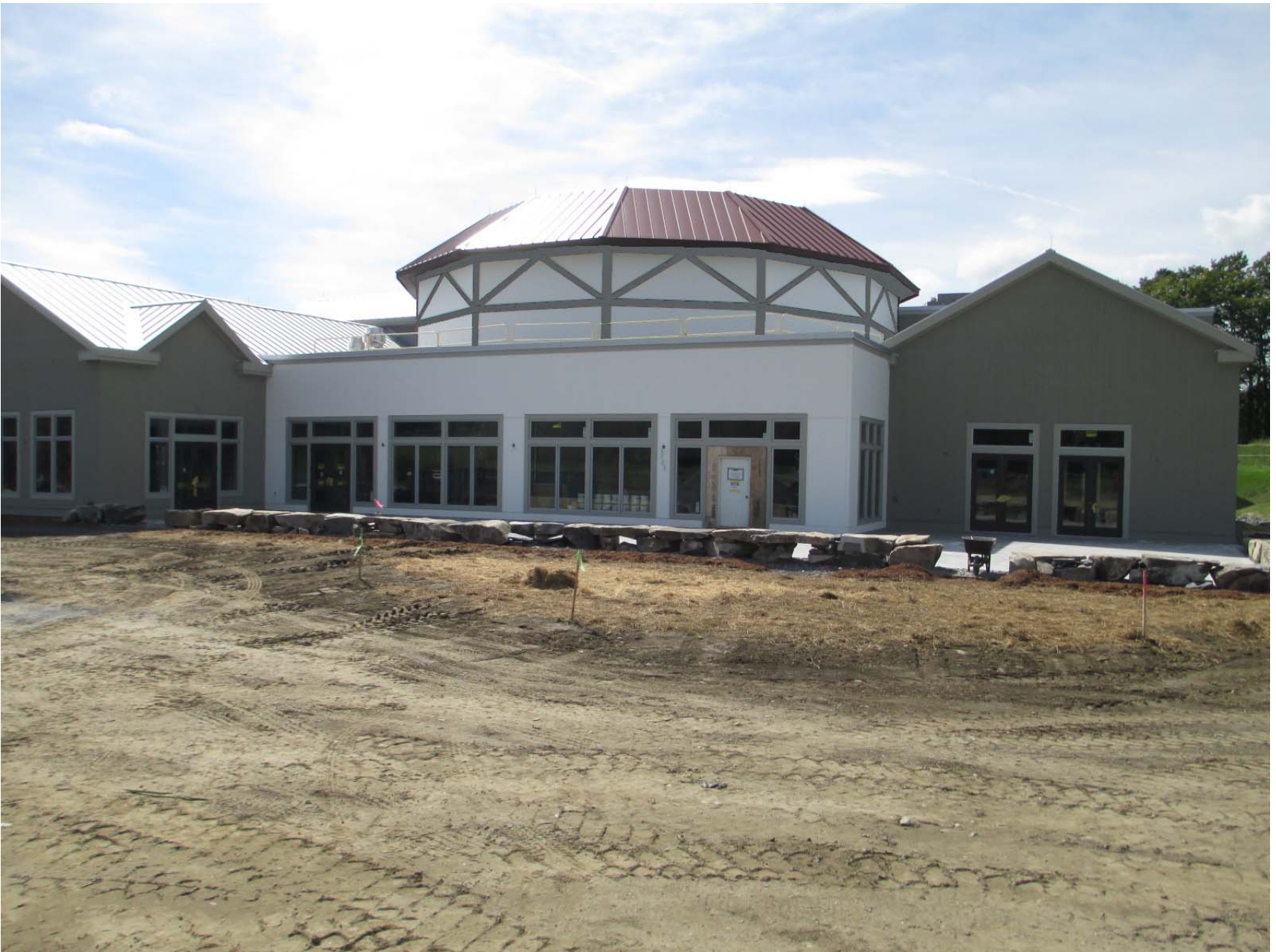
CYBRESS MOSS ALTERNATIVE (RENDERED)