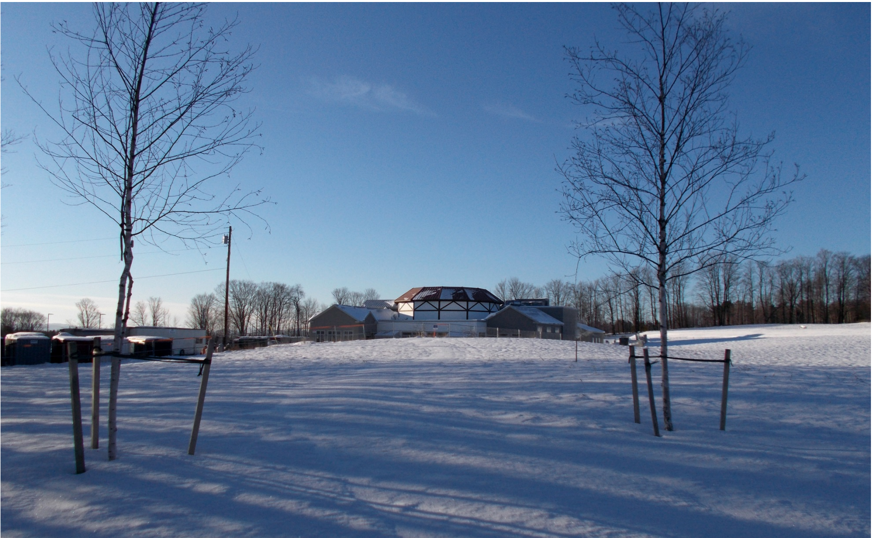
EXISTING TIMBER TRIM NEAR CENTER ROAD (12/19/2016)