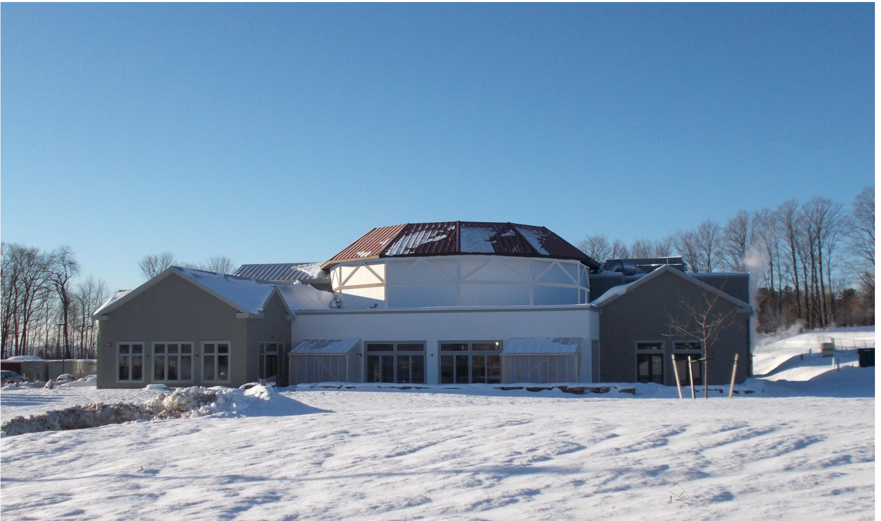
WHITE TRIM ON SILO - NEAR (RENDERED)