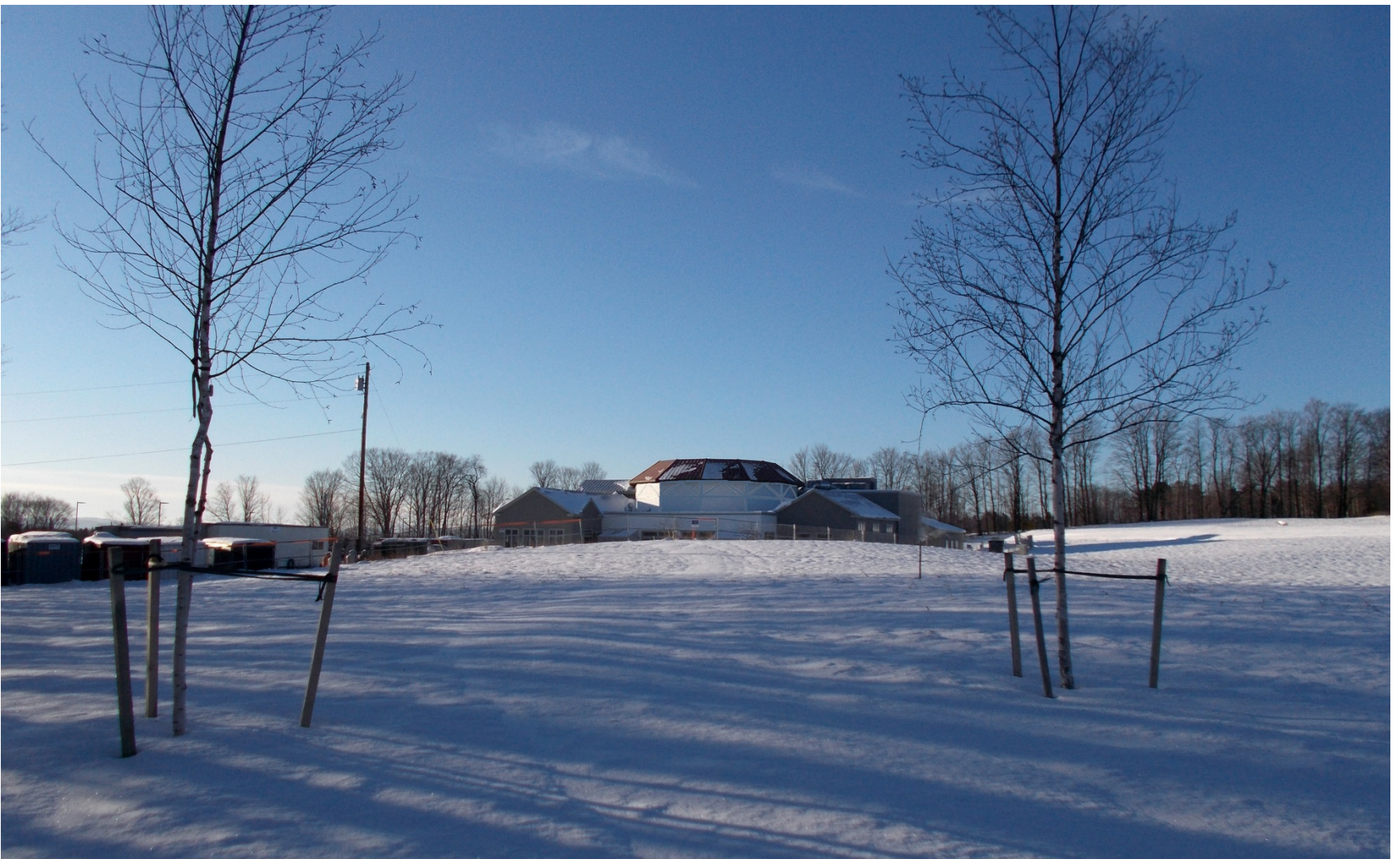
WHITE TRIM ON SILO NEAR CENTER ROAD (RENDERED)